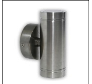
WALL MOUNTED LIGHT