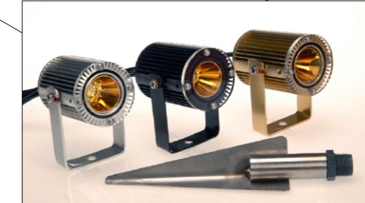
GARDEN SPIKE LIGHT & SUBMERSIBLE LIGHT

LIGHTING NOTES -Lighting positions and specifications are of designers recommendation only -Lighting products to be approved by the client and designer prior to installation -All lighting & electrical to be installed by a qualified electrician